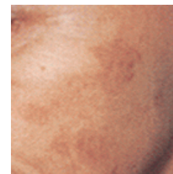
Age Spots and Wrinkles