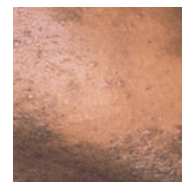
Ingrown Razor Hairs